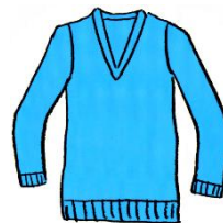
a jumper (pullover)